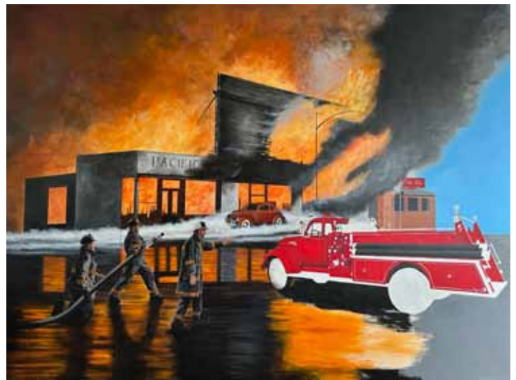
THE LATEST STATUS OF THE CHEIM LUMBER FIRE PAINTING, SEPTEMBER, 2023. THIS PAINTING IS LOCATED UNDER THE REAR AWNING AT OLD FIRE STATION ONE AND IS ABOUT 15 FEET TALL BY 25 FEET LONG.