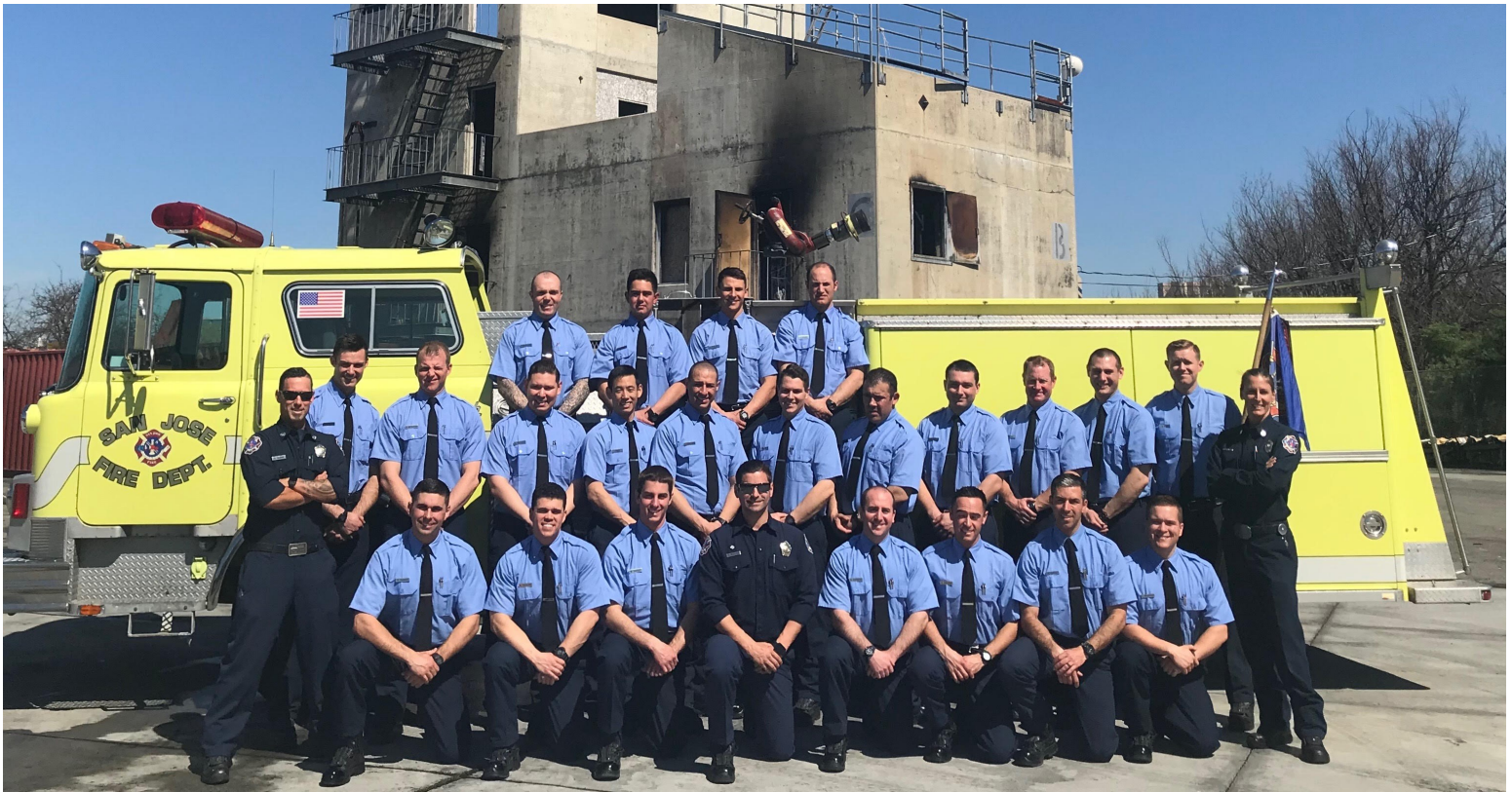
Class of 2018-1, 22 SJFD Recruit Firefighters taking their class picture before graduation in front of a 1990 Mack Fire Engine that served at Old Fire Station One when it first went into service