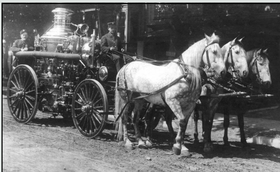
Historic black and white images of SJFD horses from the photo archives of the San Jose Fire Museum.