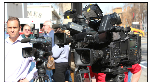
The check presentation ceremony was broadcast by three of the Bay Area's top television news stations and received coverage from other radio and print media reporters.