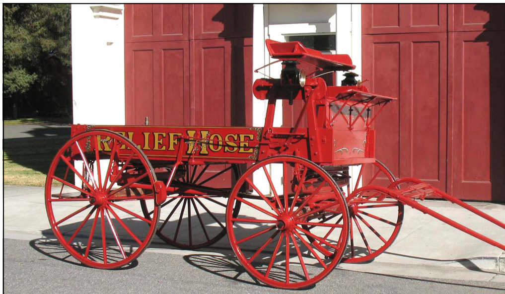
Photo At the Left: The SJFM's recreation of Relief Hose Co. No. 5 was prominently displayed at the 160th Anniversary Firefighters' Ball.

Everyone involved with this great moment - including our sponsors, the many volunteers, the Jesse Charles Band, the San Jose Elks Lodge, and our speakers for the evening - can be very proud of this significant milestone in the history of the SJFD.