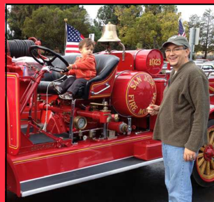
'23 Torpedo at Classic Chevy Club of S.C. Valley's Toy Drive at Cathedral of Faith.

For the second year, our popular Engine 1/2 was a hit with visitors at San Jose's Christmas in the Park.