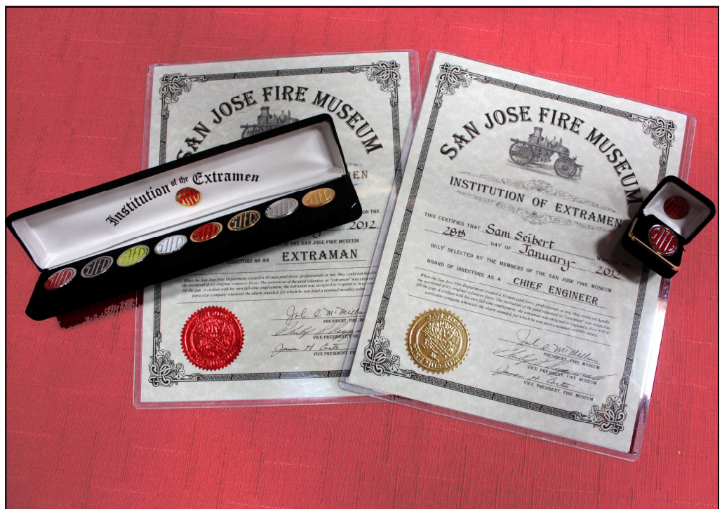
The photo above shows the complete "Institution of the Extramen" gift set. The entire award package includes two certificates of achievement, eight lapel pins and two display cases. The "Foreman" lapel pin is made of sterling silver and the "Chief Engineer" pin is made of 10-karat gold.

In order for our non-profit organization to make a positive impression on potential major partners from the private sector, we need your support.