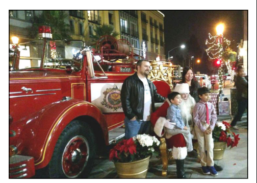
The Museum's 1951 Mack fire engine appeared at the Santa Row Shopping District in support of the Bomberos' Holiday Toy Drive.